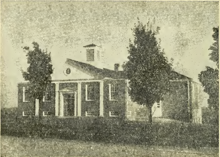
New Central School—1947